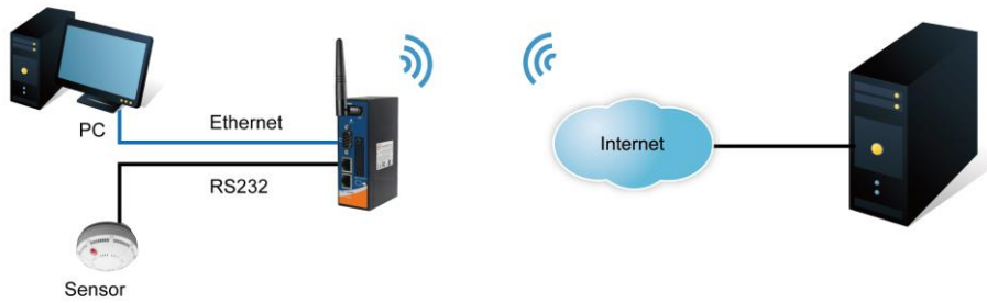
M2M Gateway Connection

IMG-311DL-MN LTE Cat-M1 or Cat-NB Modem dial up. The utility- M2M-Tool which is used to manage and monitor all of the serial ports on IMG-311DL-MN.