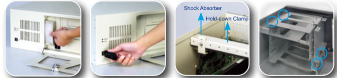
Replaceable fan filter