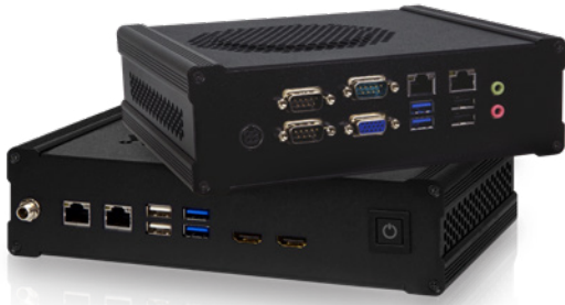
▼ BRICK Chassis with WAFER-AL (SBC not included)