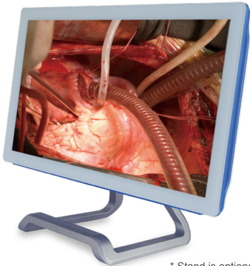
* Stand is optional