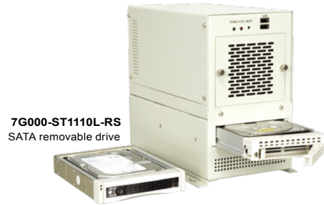
3.5" SATA removable drive bay compatible