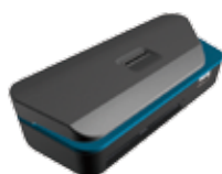
Combo Card Reader