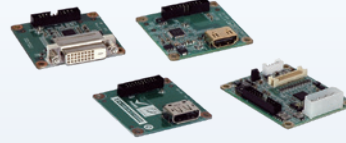
iDP converter cards with brackets