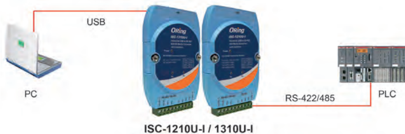
Connections of USB to Serial Media Converter

The ISC-1210U-I / ISC-1310U-I converter is an intelligent, stackable expansion module that connects to a PC USB port or USB Hub via the Universal Serial Bus(USB) port, providing one High-Speed RS-232/RS-422 or RS-485 serial port(jumper-less). The ISC-1210U-I / ISC-1310U-I features easy connectivity for traditional serial devices. The RS-232 standard supports full-duplex communication and handshaking signals (such as RTS, CTS) and the RS-485 control is completely transparent to the user and software written for half-duplex operation without any modification. The ISC-1210U-I / ISC-1310U-I's opto-isolators provide 3000 VDC of isolation to protect the host computer from destructive voltage spikes on the RS-232/RS-422 and RS-485 data lines. ISC-1210U-I / ISC-1310U-I also offer internal surge-protection on data lines. The internal high-speed transient suppressors on each data line protect the modules from dangerous voltages levels or spikes. In addition, the ISC-1210U-I / ISC-1310U-I module derives the power from USB port and doesn't need any aid of external power adapter.