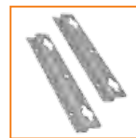
Wall Mount bracket