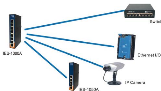
Connections of Ethernet devices

IES-1050A/1080A can be used in connecting several Ethernet devices like Ethernet I/O, IP-Camera or other Ethernet switches. In addition, there are two different power inputs at terminal block to avoid interruption caused by power down. When the primary DC power input fails, the backup power input will take over immediately to guarantee a non-stop operation.