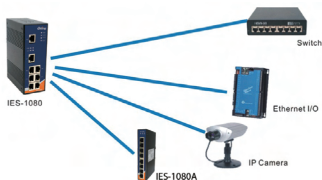
Connections of Ethernet devices

IES-1080/1062 series can be used in connecting several Ethernet devices like Ethernet I/O, IP-Camera or other Ethernet switches. In addition, there are three different power inputs to enhance its reliability, two supplied by terminal block, and one by power jack to avoid interruption caused by power down. When the primary DC power input fails, the backup power input will take over immediately to guarantee a non-stop operation.