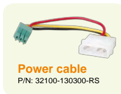
Power cable P/N: 32100-130300-RS