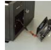
Step 2: Pull the fan out gently