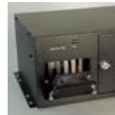
Step 1: Loose the thumb screws