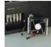
Step 3: Unplug the power connector